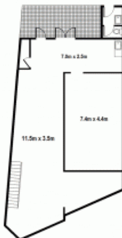
Tenancy 1 First Floor

DISCLAIMER DIMENSIONS ARE APPROXIMATE AND SHOULD ONLY BE USED AS A GUIDE THEY ARE NOT TO SCALE AND NO LIABILITY WILL BE ACCEPTED.