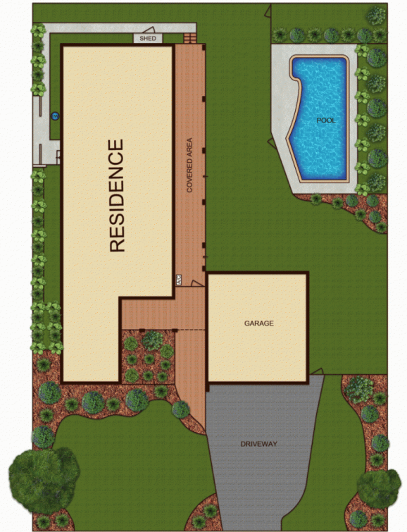
25.2m SITE PLAN