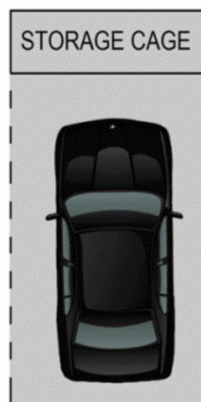
SECURE BASEMENT PARKING WITH LOCKABLE STORAGE CAGE